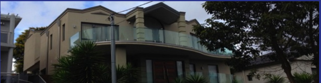
Project: 3 storey dwelling - Putney Services: Structural Design of Concrete Footings, Structural Steel, Suspended Slabs & Roof Design