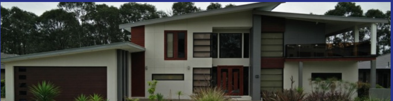
Project: Double storey dwelling - Luddenham Services: Footings, Slabs, Structural Steel & Inspections