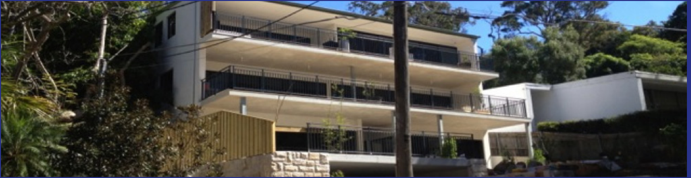
Project: 4 storey dwelling - Vaucluse Services: Structural Inspections & Certifications