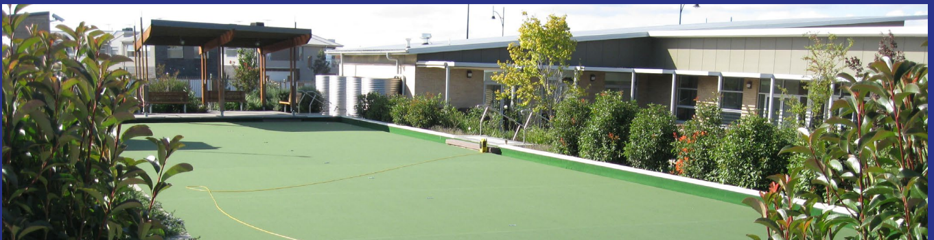
Project: Investigation of Foundation Movement to Bowling Green Services: Forensic Inspections