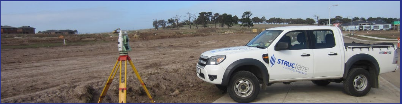
Project: Residential Development, Clyde North Services: Land Surveying Client: Various Clients