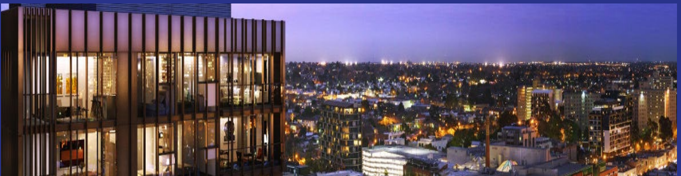
Project: Elia Apartments, South Yarra Services: Commercial and Civil Client: Six Star Construction