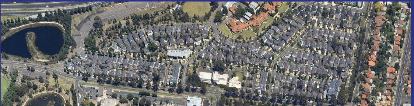
Project: Melbourne Commonwealth Games Athletes Village, Parkville Services: Structural - 2 storey homes (168 homes) Client: Australand