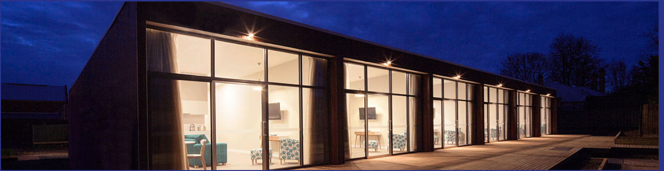
Project: Ballarat Health Services Cancer Accommodation Units, Lake Wendouree Services: Modular Design - 6 modular pre-fabricated health care units Client: Precom