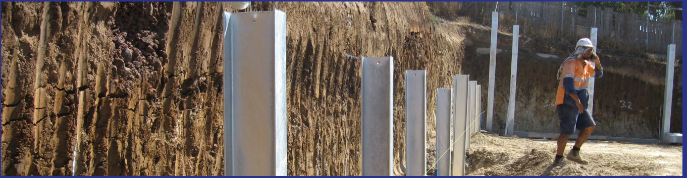
Project: Multi-Unit Residential Development, Westmeadows Services: Structural - retaining wall design Client: Australand Holdings