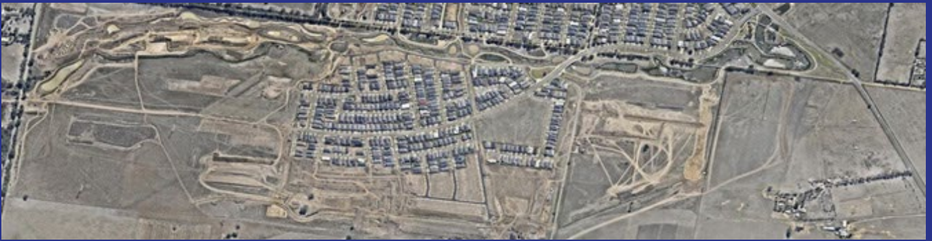
Project: Residential Development, Armstrong Creek Services: Land Surveying, Geotechnical & Structural Client: Various Clients